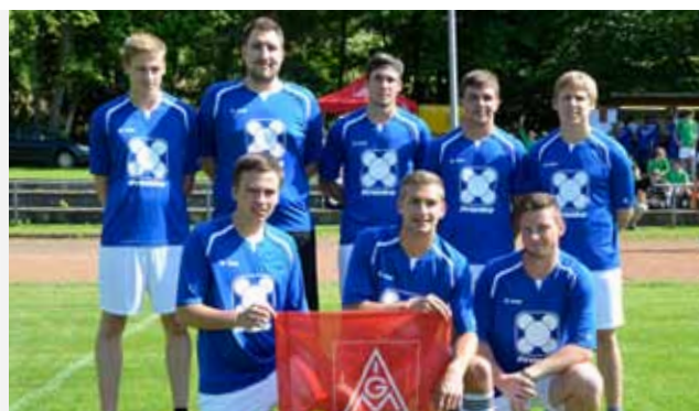
The Franke team pose in the DJK Stadium in Aalen just before kick-off of the hard fought tournament.

Twenty teams took part on 21 st June 2013 at the 6 th football tournament of IG-Metall-Jugend Aalen and Schwäbisch Gmünd at the DJK Stadium in Aalen. A team of Franke apprentices and former BA students also took part in the tournament. The Franke team put up a good fight and ultimately earned a decent place.